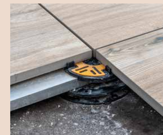
IMPERTEK MAG. #01

To connect the slope changes in the best possible way, it was decided to use Rail System, the modular system consisting of joists that make the underlying support structure more compact and adaptable to sudden changes in slope. Furthermore, Rail System is ideal both for decking and stone or ceramic tiles of any shape and size. For example, in the various corners of the swimming pools, the ceramic plates were cut diagonally to follow the change in slope, then the aluminium Rail were locked along the diagonals to improve their stability. In some areas were created some steps and it was possible to insert a lighting system in the riser. In addition, to ensure greater safety to the flooring, the areas where