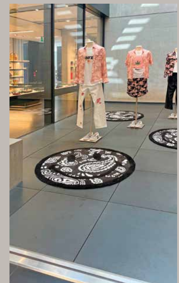
IMPERTEK MAG. #01

Impertek supports were chosen because they combine stability, efficiency and speed of realization